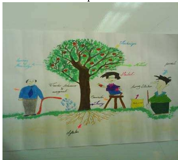
Figure 3. Reflection toward education and its education and components